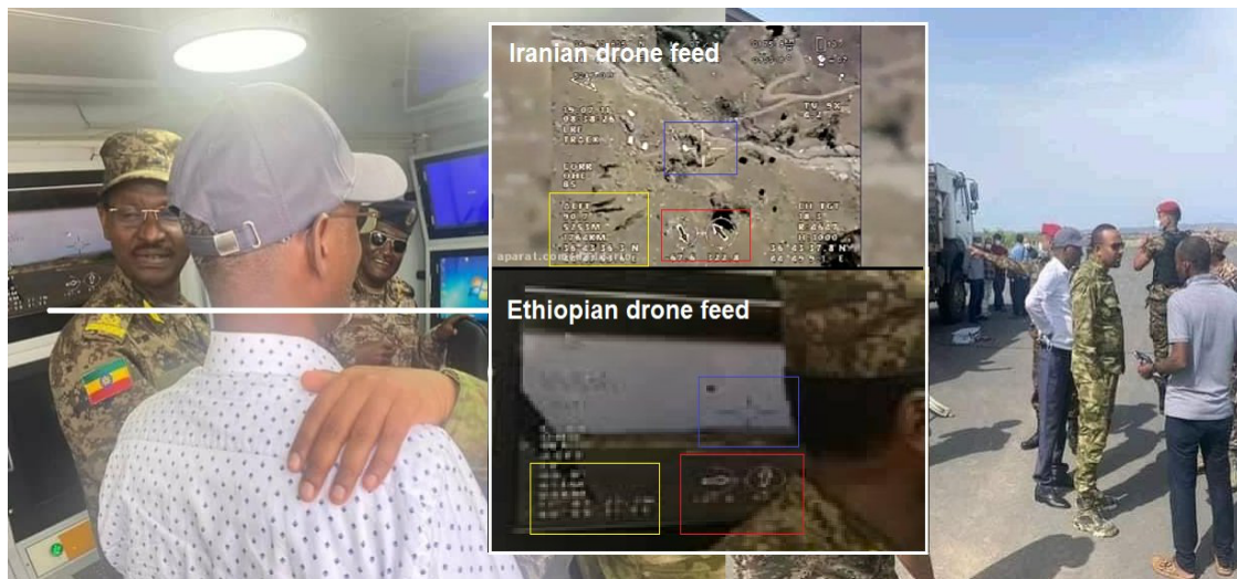
Figure 3. Ethiopian Drone Feed from 03 January 2023, overlaid with Iranian GCS display from 2019. (U)