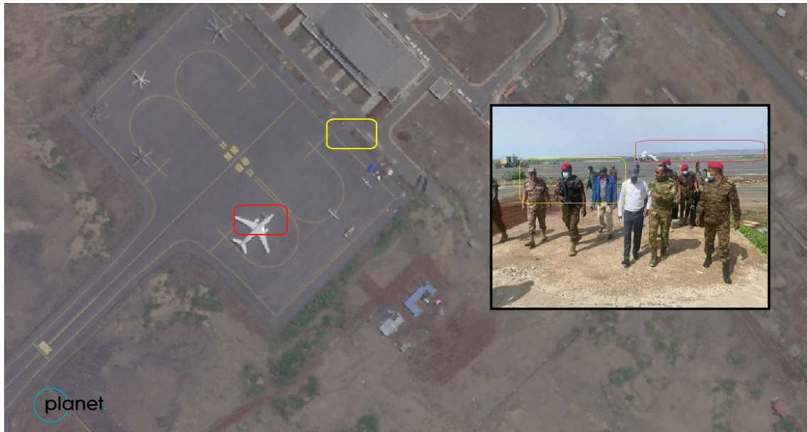
Figure 2. Semara Airport, 03 Jan 2023. Planet SkySat. (U)